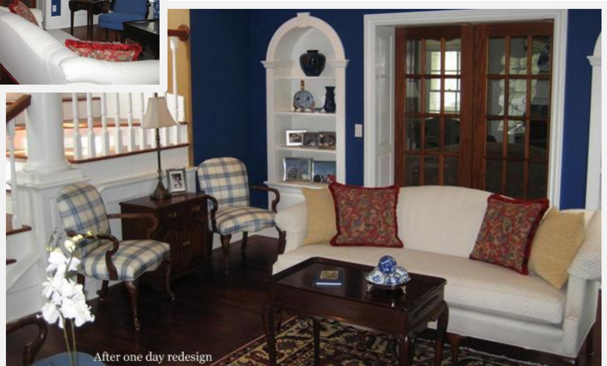
After one day redesign

A quick trip to the store for the coordinated silver tone frames and two yellow throw pillows and the room was finished in a few hours.