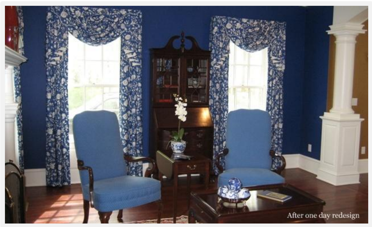
After one day redesign